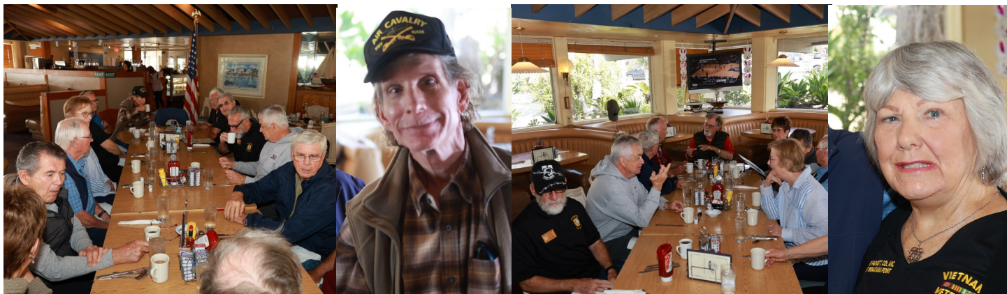
On Saturday, March 29 th , Post 9934 hosted a breakfast for our Vietnam Veterans in honor of National Vietnam War Veterans Day. The breakfast was held at The Brig Restaurant in Dana Point.