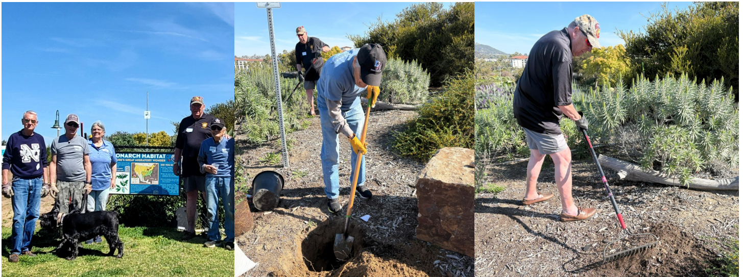
On March 22 nd , Post members gathered at Sea Terrace Community Park to assist the City of Dana Point in their Monarch Butterfly Habitat Workday.