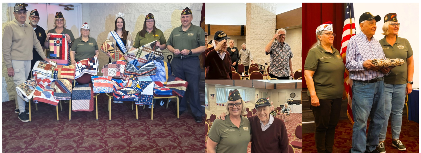
On February 16 th , VFW California Department, District 2, and Post 9934 Officers presented handmade quilts to the Veterans who reside at The Towers at Laguna Woods.